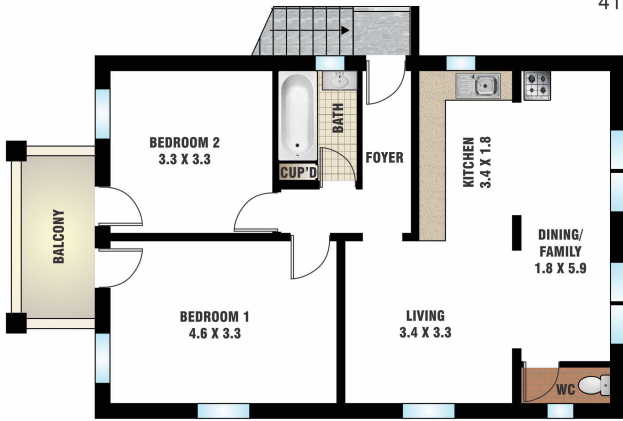
UNIT 2 - FIRST FLOOR